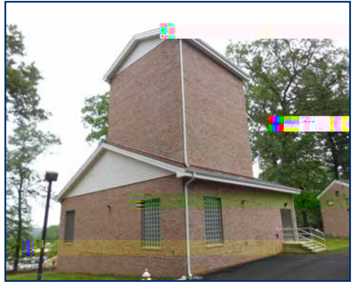
New Manhasset-Lakeville Water District water treatment facility funded by Lockheed Martin to provide clean water to their customers.

In April 1993, Unisys installed an interim groundwater treatment system (Operating Unit 1, OU1) to begin removing volatile organic compounds from the on-site groundwater at the 90-acre site's northern boundary and to contain the movement of the plume. The 1997 Record of Decision (ROD) issued by the New York State Department of Environmental Conservation (NYSDEC) directed installation of a state-of-the-art groundwater treatment system to replace the interim system. Lockheed Martin began construction of this system in 2001 and it began operation in August 2002. A separate Record of Decision for off-site groundwater, released by the NYSDEC in late 2014, approved Lockheed Martin's proposal to upgrade the capacity of OU1 from 730 gallons per minute to 850 gallons per minute by adding an additional deeper well for extracting groundwater from the plume for treatment. Design of the upgrade to the groundwater treatment plant began in 2015 and construction was completed in 2018. The system is now operating at 850 gallons per minute.