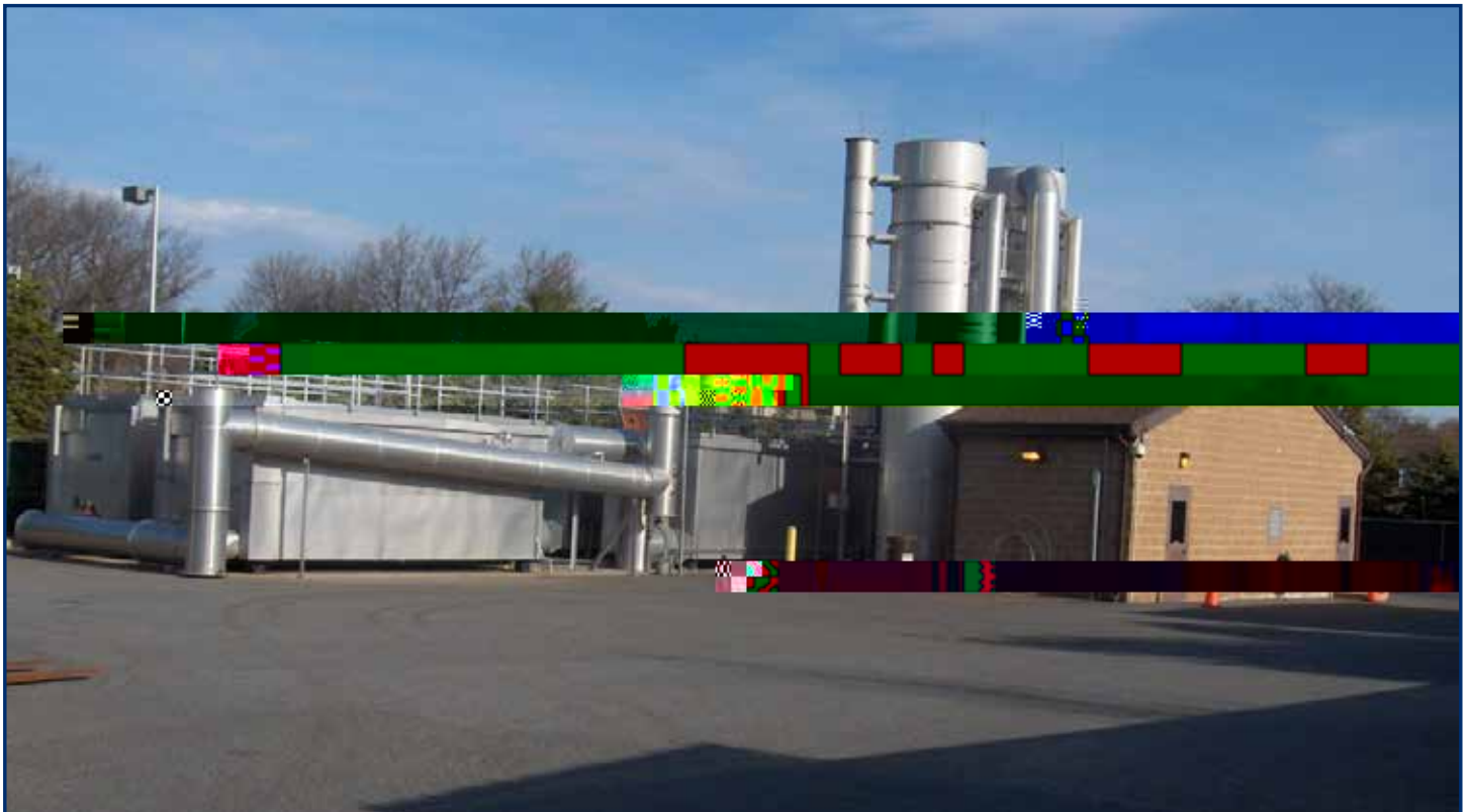
On-Site (OU1) Groundwater Treatment System