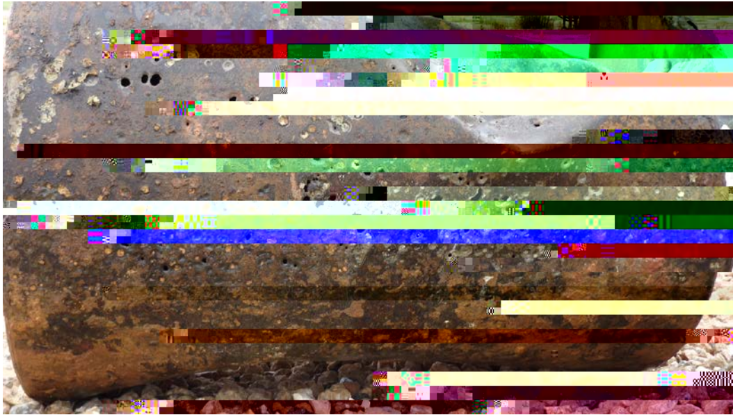
UST # 1 perforations