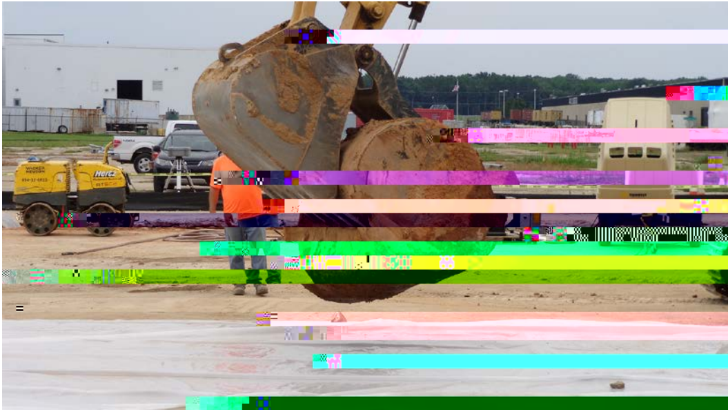
UST #1 extraction