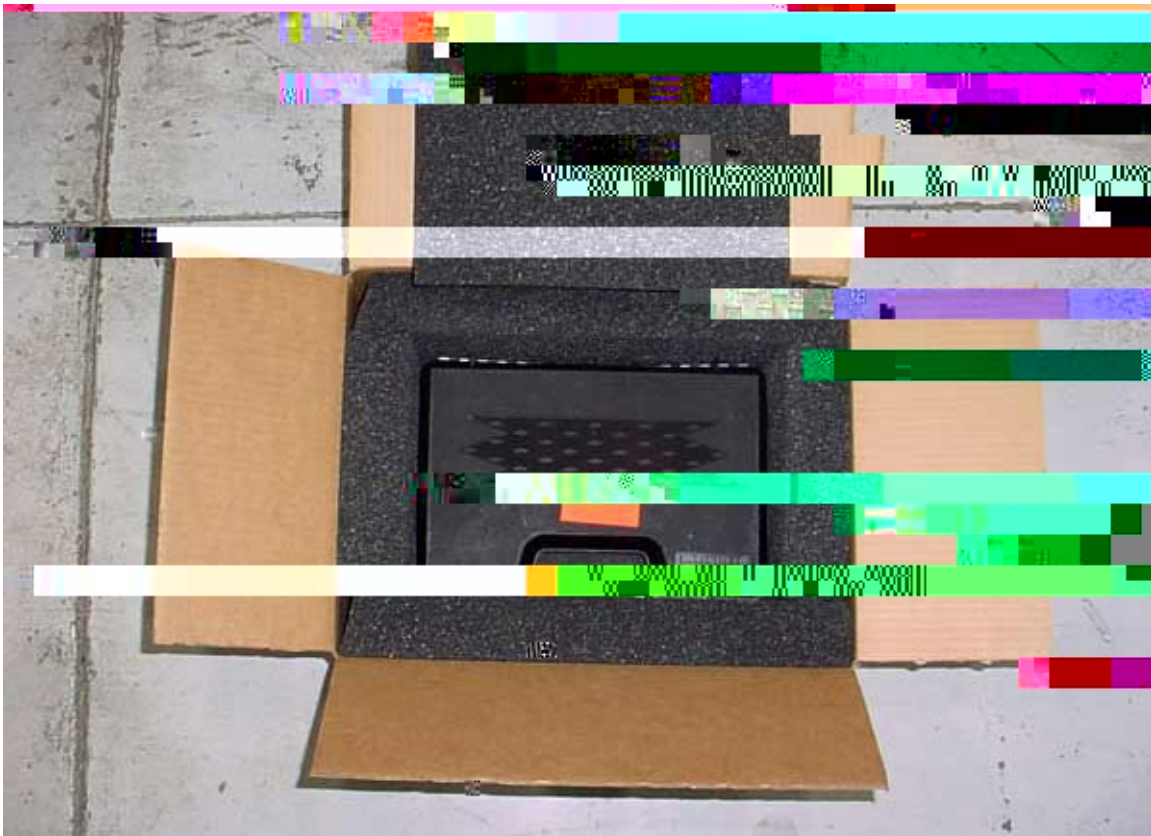
Figure 1. Delicate Product/Equipment – Fiberboard Box Overpack